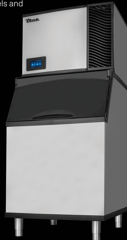
TI-630-MA-S1-A~T-1 & TIB-530