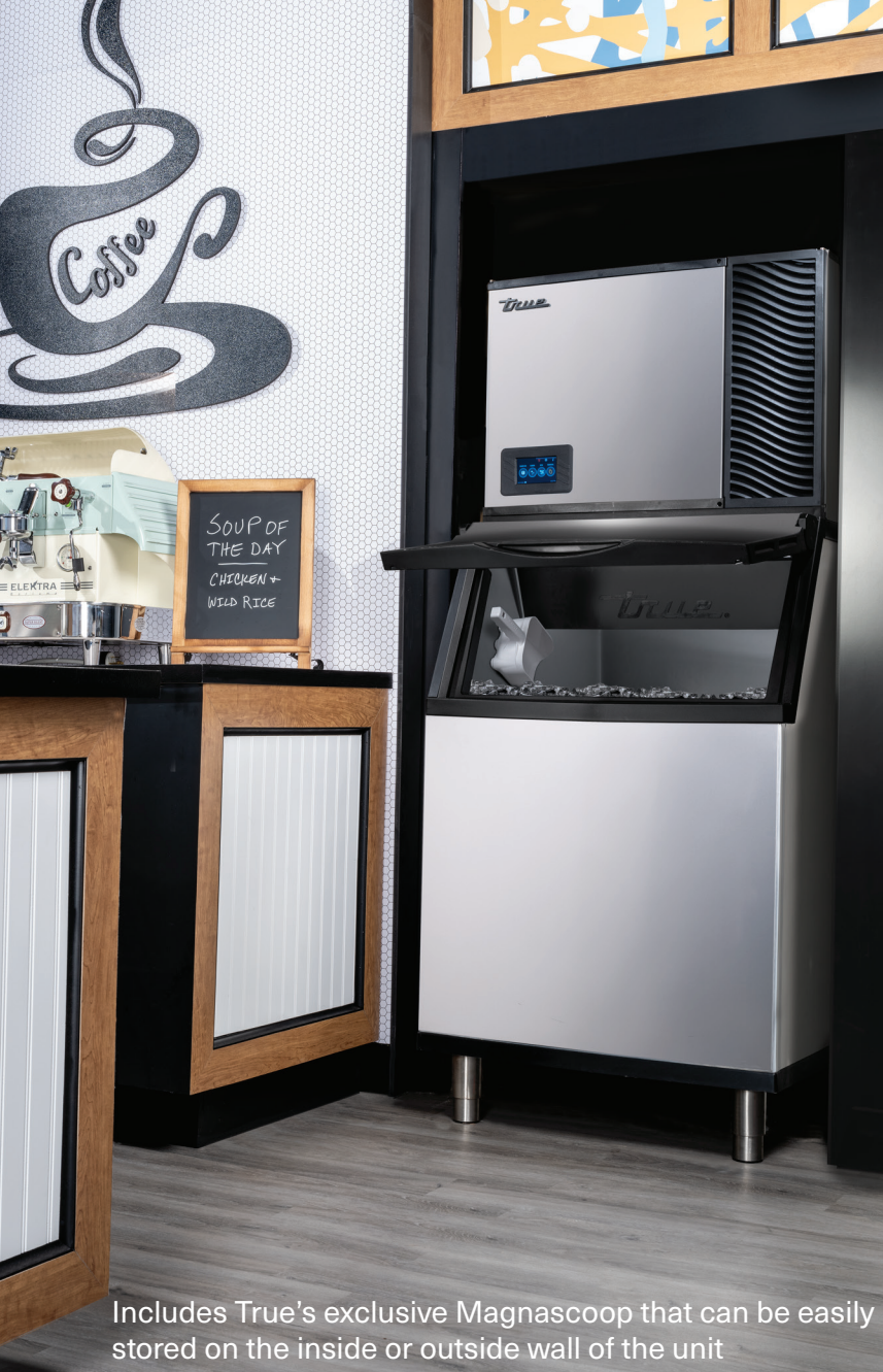
Includes True's exclusive Magnascoop that can be easily stored on the inside or outside wall of the unit