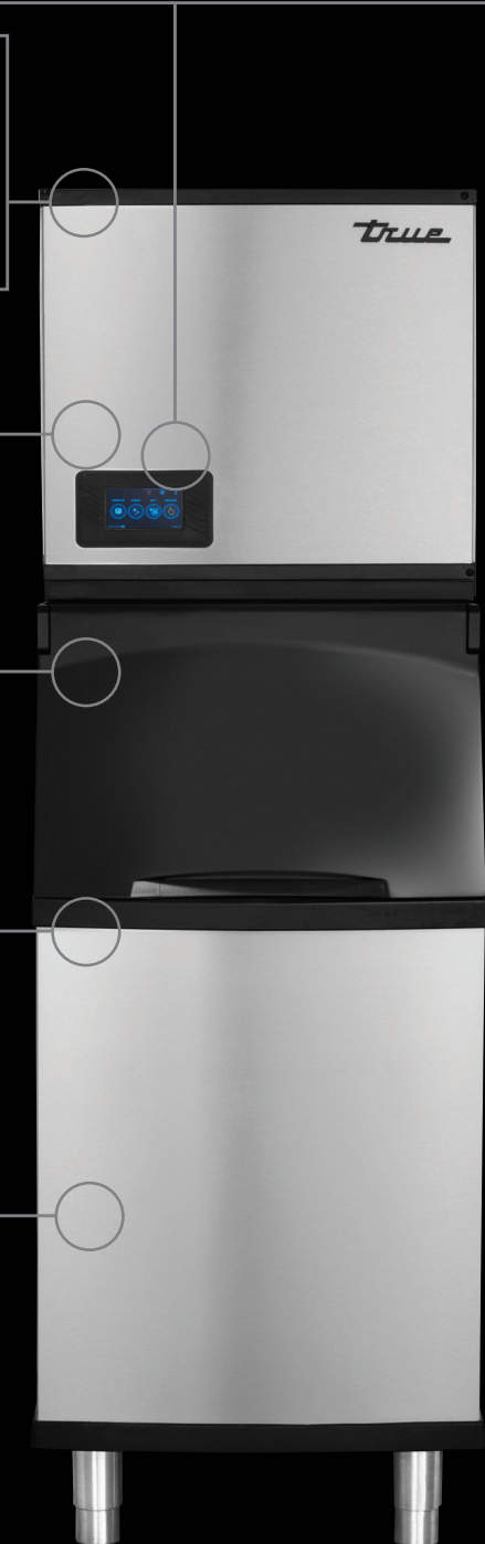
TI-522-MA-S1-A~T-1 & TIB-422