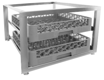
Universal Pedestal (24"W X 25-3/8"D X 15-1/4"H)