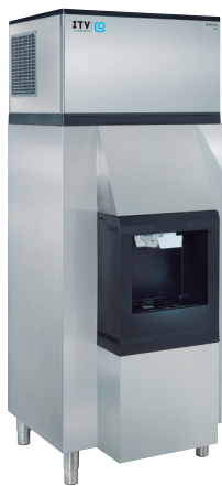
SIRION DHD 200-30 + SPIKA MS 500