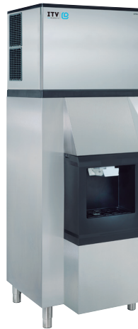
SIRION DHD 200-30 + SPIKA MS 1000