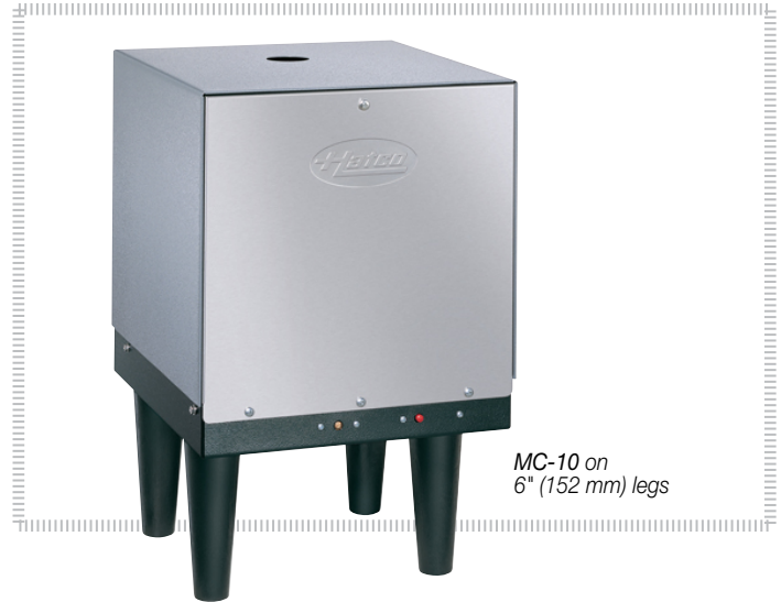
MC-10 on 6" (152 mm) legs