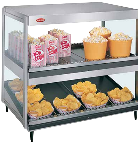
GRSDS/H-36D with slant and horizontal shelves and optional 15" clearance top shelf