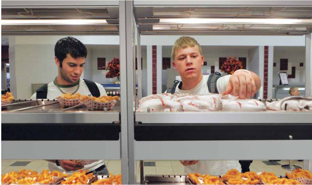
GRSDS-36D with dual slanted shelves