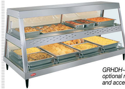
GRHDH-4PD with pan rail, optional mirrored glass doors and accessory food pans