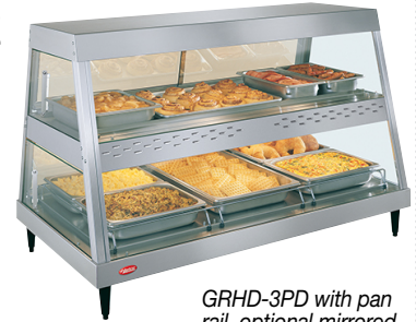
GRHD-3PD with pan rail, optional mirrored glass doors, and accessory food pans