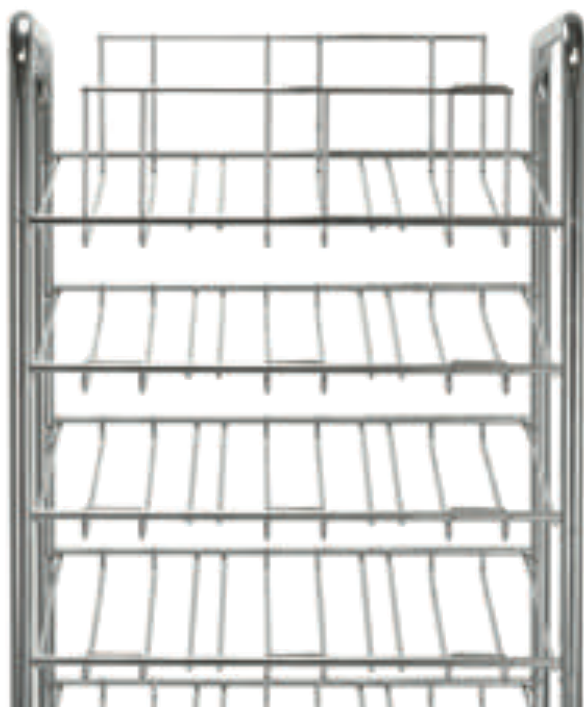
DC96 Dough Cart

Loading and unloading is fast, easy and practically automatic with the gravity flow. The chutes are sequentially feeding, first-in, first-out.