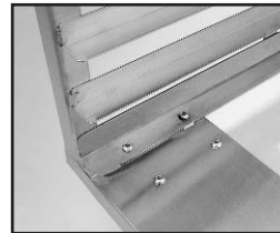
High strength heliarc welded ledges.