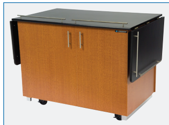
Optional Hinged Doors