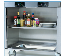
Interior Storage Shelf