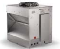
ECC1200 Remote Condensing Unit