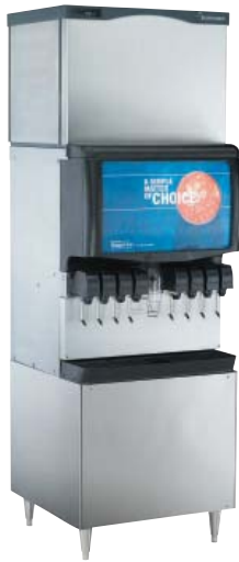
EH330 shown on beverage dispenser.