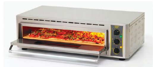
CAPACITY: 1 - 16" x 24" rectangular pizza or several personal size pizzas