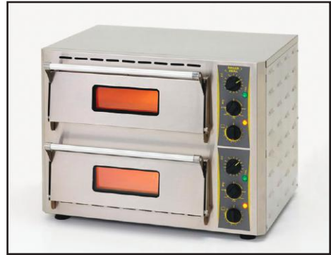
PZ 430D 208/240 V CAPACITY: 2 - 16" pizza