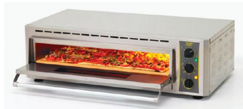
CAPACITY: 1 - 16" x 24" rectangular pizza or several personal size pizzas