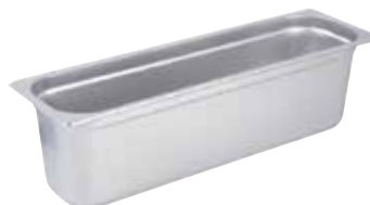
SPJH/SPJL-SERIES HALF LONG STEAM PANS