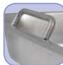
Patented handle system