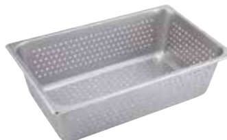
SPJH/SPFP-SERIES PERFORATED STEAM PANS