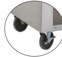
Optional TA-255P Casters Available