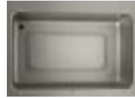
Sealed Well with Drain