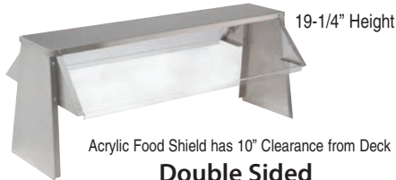
19-1/4" Height Acrylic Food Shield has 10" Clearance from Deck Double Sided Self-Serve Buffet Shelf with Built-In Food Shield