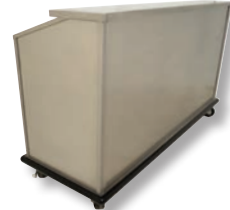
-SS Stainless Steel Panels (Includes Bar Top)