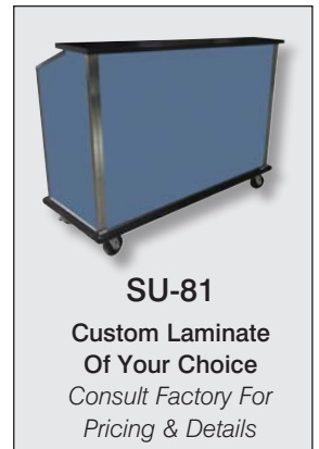
SU-81 Custom Laminate Of Your Choice Consult Factory For Pricing & Details

Add Model Number At End Of Portable Bar Model Number When Ordering (Example: R-8-B-LCW)