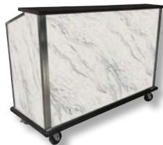
-LCM Calcutta Marble Laminate