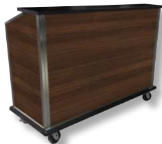
-LCW Columbian Walnut Laminate