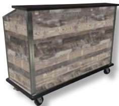
-LMP Marula Pine Laminate

Applied To Portable Bar Front And Sides ONLY, Unless Otherwise Specified