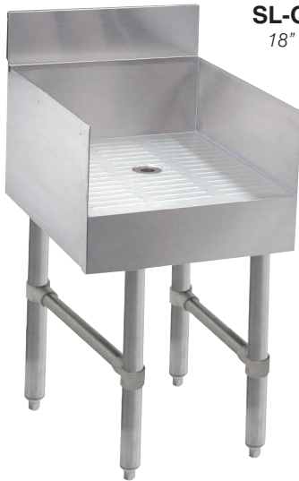
SL-GS Series 18" Wide Units