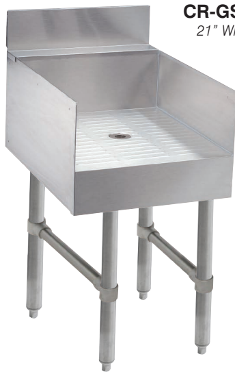
CR-GS Series 21" Wide Units