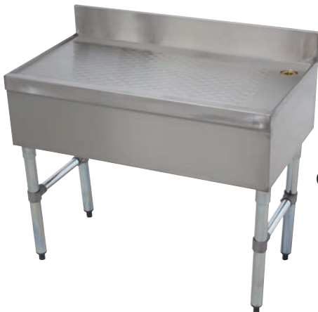
CRD Series 21" Wide Units