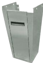
Pedestal Base Only 7-PS-37