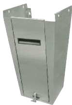
With Foot Valve 7-PS-33