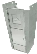
Add Trash Receptacle For 7-PS-33, 7-PS-37 or 7-PS-37B Only 7-PS-29

*Pedestal Base For 7-PS-20 and 7-PS-20-NF Hand Sinks 7-PS-37B