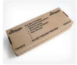
Fast & Easy Assembly

We designed our panels so that job-site installation is fast and easy. All walk-ins are shipped with a hardware and installation instruction kit that includes: the shop drawing, detailed installation instructions, hex wrench for cam-lock panel assembly, PVC press fit caps and the light globe.