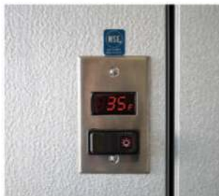
Digital LED Thermometer & Switch