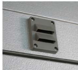
Heated Pressure-Relief Vent

The door jamb and door are constructed with a non-conductive heavy-duty PVC extrusion that provides a thermal barrier. The jamb includes an incandescent vapor-proof light fixture mounted on the center/top of the jamb, which provides extra space for shelving posts. A digital LED Thermometer (F°/C°) is provided, with On/Off pilot light switch.