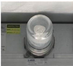
Vapor Proof Light