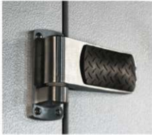
Spring Assisted Hinges