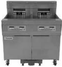
Model Shown: 21814E with optional filtration