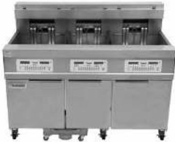
Model Shown: 11814E/RE17/11814E