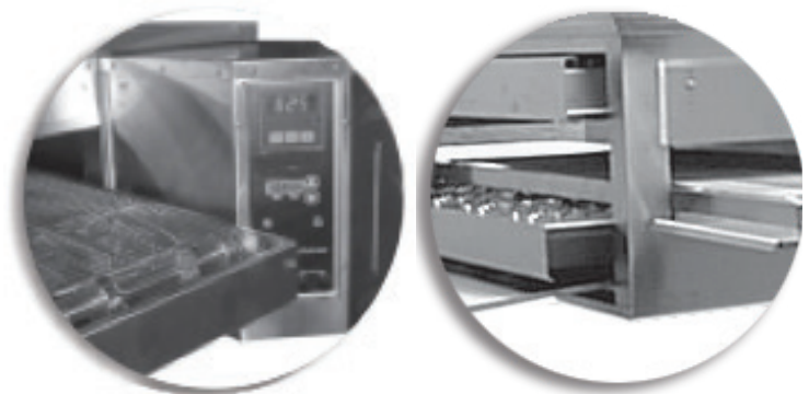
Removable panels for easy cleaning