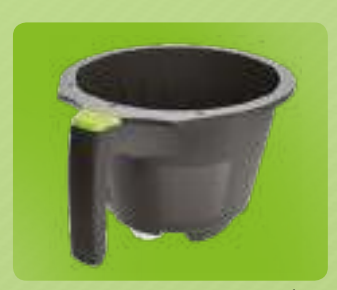
Brew Basket for TBS-2121XTS 15" Dia. x 51/2"D #B013000BE2