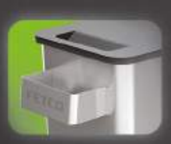
Style Modern European style elevates your iced tea service with an attractive, inviting self-serve atmosphere.