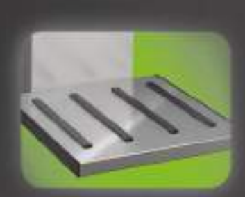
Solid Construction FETCO's reputation is second to none for precision craftsmanship and everlasting durability.

* Shown with 2ea. 3.5 Gallon Iced Tea Dispenser (ITD-2135). (Sold separately.)