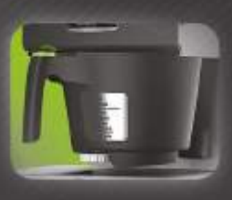
Functional Design New features and exclusive designs provide an extraordinary tea service experience for both operators and consumers.