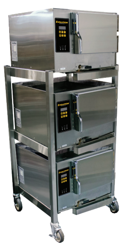
E3 Evolution™ Model shown triple stacked on stand with casters

Evolution™ steamer is AccuTemp Products' connected, boilerless steam cooker that utilizes AccuTemp's patented Steam Vector Technology for faster cook times, improved energy efficiency, better pan to pan uniformity, and less water consumption. Steam Vector Technology requires no moving parts inside the cooking chamber. Steam to be produced inside the cooking cavity with no heating element exposed to water. Easily connects to water and drain line. Uses less than 1.5 gallons of water per hour. Unit to include low water, high water, overtemp warning lights and auto shut off feature. Evolution™ to include heavy duty, field reversible door. Standard digital controls with independent timer. No water quality exclusions to warranty and no water filtration or treatment required. Unit to be UL Safety and Sanitation Certified, and Energy Star qualified. Built in USA.