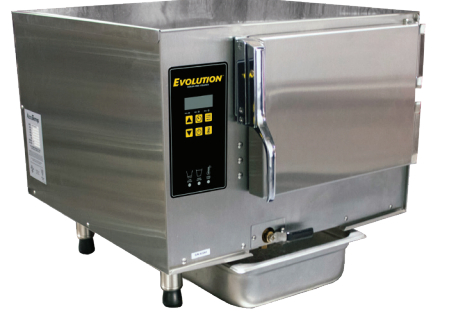
E3 Evolution™ Model shown with optional bullet feet and optional drain pan