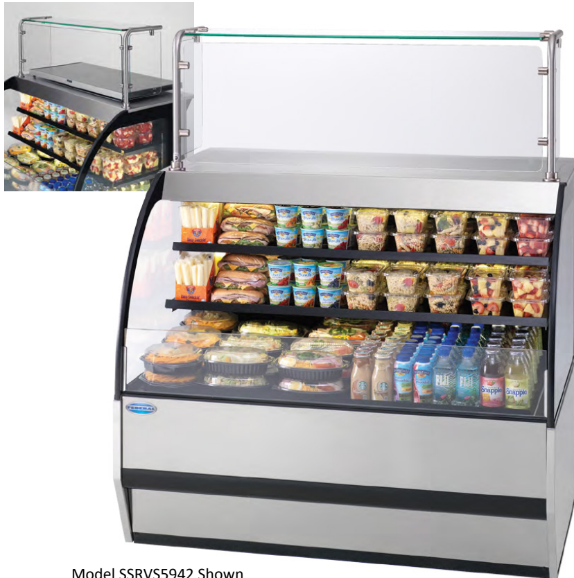
Model SSRVS5942 Shown

Designed for those customers looking for up-market styling for maximum visual appeal that will drive product sales.