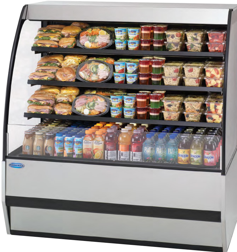
Model SSRPF5952 Shown

Designed for those customers looking for up-market styling for maximum visual appeal that will drive product sales.