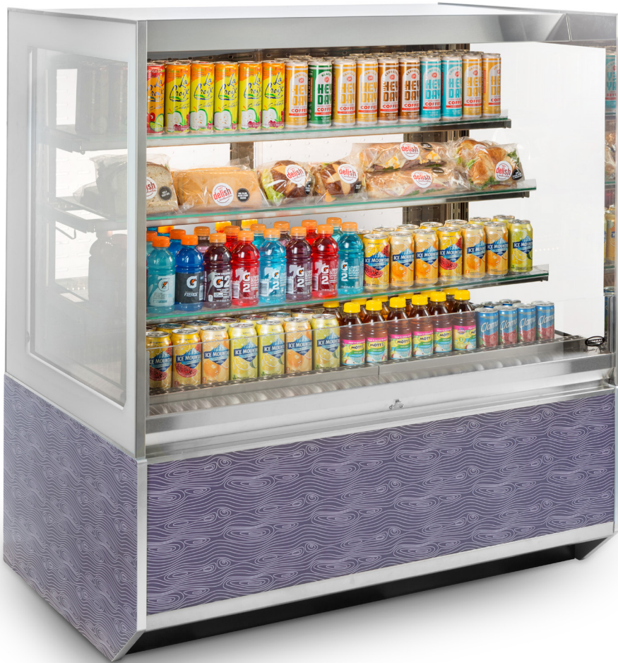
Model ITRSS4834-B18 Shown with optional laminate

Designed for customers looking for a rich, up-scale Italian styling for maximum visual appeal that will drive product sales.