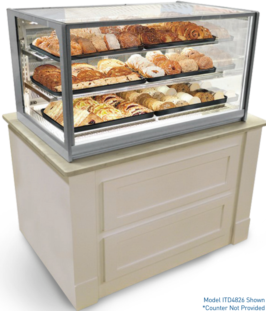
Model ITD4826 Shown *Counter Not Provided

Designed for customers looking for rich, up-scale Italian styling for maximum visual appeal that will drive product sales.