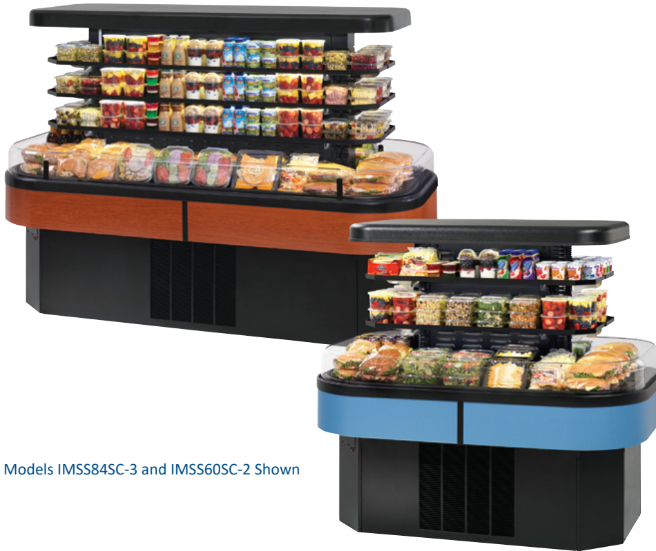
Models IMSS84SC-3 and IMSS60SC-2 Shown

Designed with impulse sales in mind. Get maximum return and increased profits with shop-around merchandising.