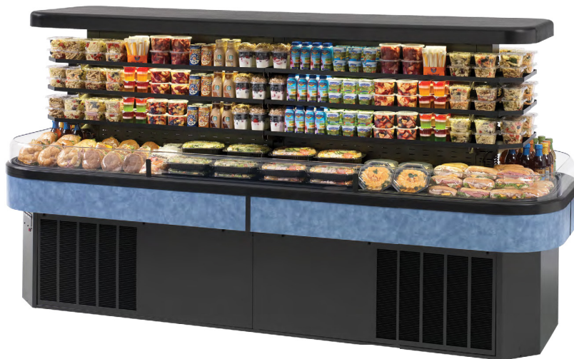
Model IMSS120SC-3 Shown