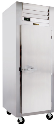
Model Shown One Section (shown with optional casters)