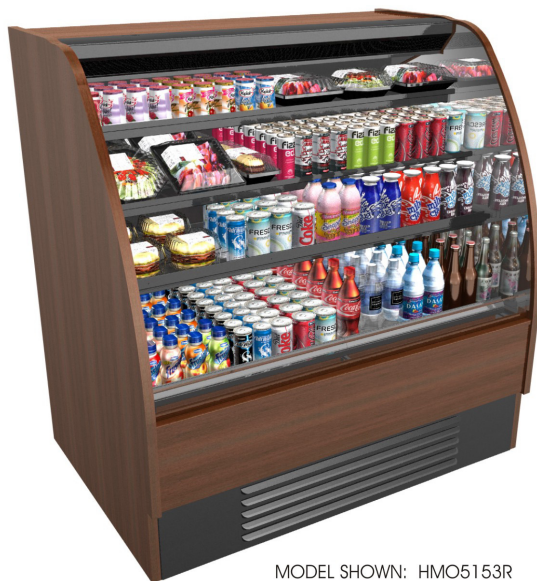
MODEL SHOWN: HMO5153R