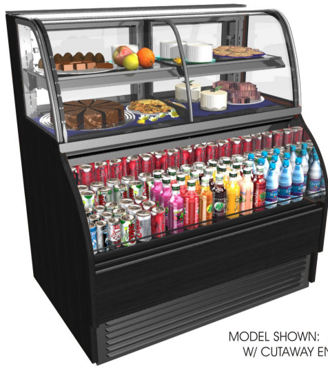
MODEL SHOWN: HMBC4-E3 W/ CUTAWAY END PANEL

NOTE: NON-DIVIDED UPPER DISPLAY AREA - HMBC2-E3 & HMBC3-E3 DIVIDED UPPER DISPLAY AREA - HMBC4-E3, HMBC5-E3 & HMBC6-E3