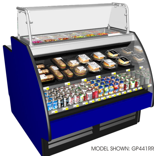
MODEL SHOWN: GP441RR

NOTE: INTERIOR PANS NOT PROVIDED W/CASE GP441RR HOLDS (2) FULL SIZE 4"D PANS GP641RR = (3) PANS - GP841RR = (4) PANS