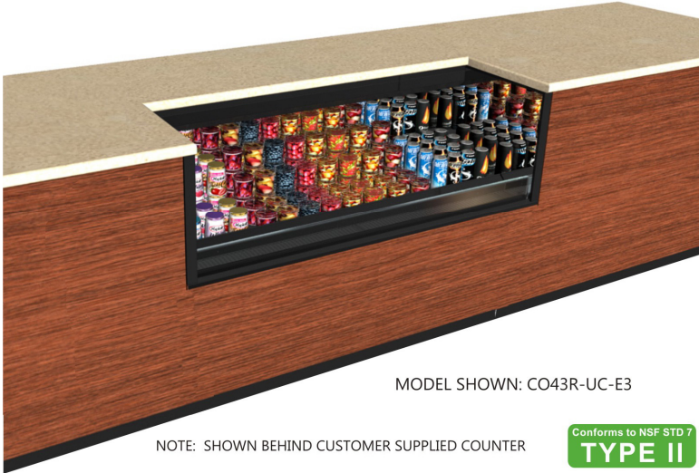
MODEL SHOWN: CO43R-UC-E3

NOTE: SHOWN BEHIND CUSTOMER SUPPLIED COUNTER