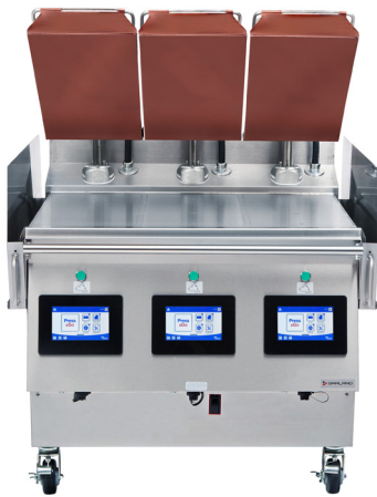
Model XPE36 Shown with flared grease cans