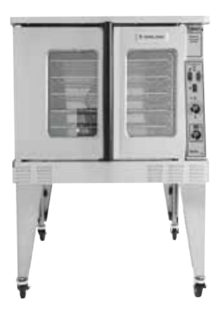
MASTER OVEN Premium Quality