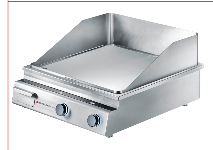
INSTINCT Griddle 7 / 10