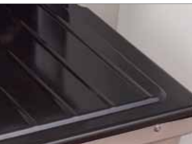
Oven design features and power deliver a better bake

Garland's Chef Oven is so large it holds standard full size sheet pans in either direction. Best-In-Class for temperature consistency and recovery time making easy work of all your baking, roasting or finishing. Even our 24" range accepts a full size sheet pan.