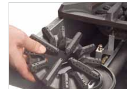
2-piece burners for easy cleaning inside and out