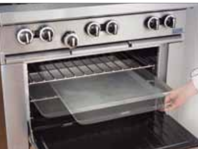
Larger Chef's Oven holds sheet pans in both directions

Garland's exclusive two piece 26,000 BTU Starfire Pro Burner combines concentrated power with precise even heat for improved efficiency and heat control.