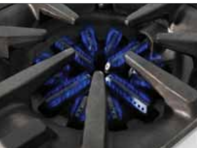
26K BTU Starfire Pro Burner delivers concentrated heat

At 27" deep, the new Garland Restaurant Range has the largest usable cooking surface in the industry. The new grate design allows pots to slide easily across the surface from burner to burner. Fits six 12" pots easily.