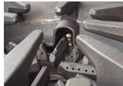
Pilot Lights are protected outside of the spill zone

The fully porcelain interior, ribbed door and hearth and a 38,000 BTU cast iron "H" Burner combine to generate and distribute heat faster and more evenly. Best-in-class results and industry leading recovery are achieved by unmatched temperature consistency and simply the best heat management system in the industry.