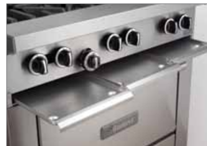
Fully sealed split crumb trays easier and safer to handle