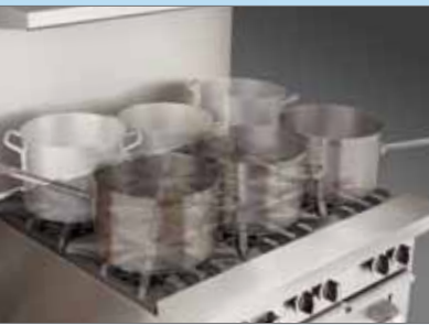
Industry leading depth holds six 12" pots easily