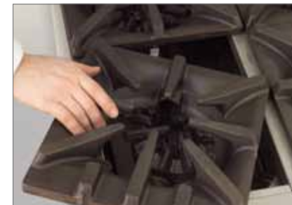
Split ergonomic grates are easier to handle and clean