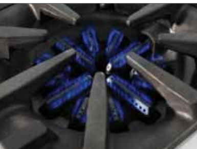
33K BTU Starfire Pro Burner delivers concentrated heat

At 27" deep, the Garland Restaurant Range has the largest usable cooking surface in the industry. The grate design allows pots to slide easily across the surface from burner to burner. Fits six 12" pots easily.