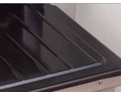
Oven design features and power deliver a better bake

Garland's Chef Oven is so large it holds standard full size sheet pans in either direction. Best-In-Class for temperature consistency and recovery time making easy work of all your baking, roasting or finishing. Even our 24" range accepts a full size sheet pan.