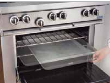
Larger Chef's Oven holds sheet pans in both directions

Garland's exclusive two piece 33,000 BTU Starfire Pro Burner combines concentrated power with precise even heat for improved efficiency and heat control.