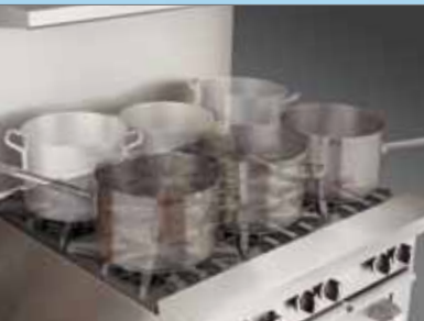
Industry leading depth holds six 12" pots easily