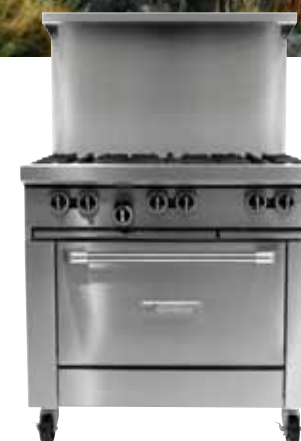
G Series Restaurant Range

Explore a Broader Range of Possibilities