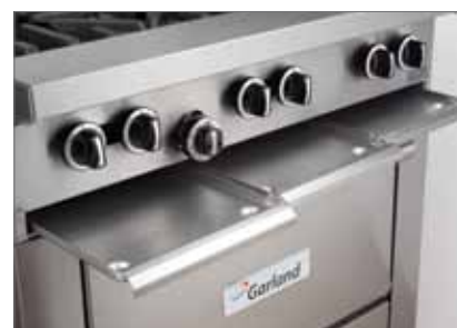
Fully sealed split crumb trays easier and safer to handle