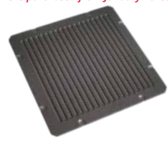
Cool down pan 1/4 size 29/16" deep