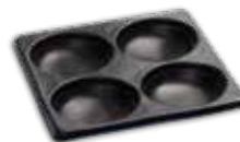
Non-stick mould 4x