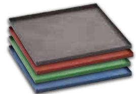
Solid base baskets (full size, black, red, green, blue)