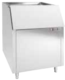
MIB400 30"W x 34"D x 37"H