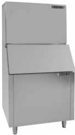
MIM615H 30"W x 24"D x 21"H