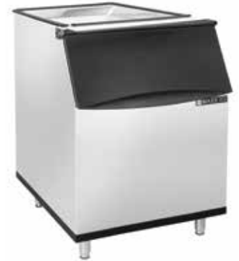
MIB580N 30"W x 34"D x 50"H