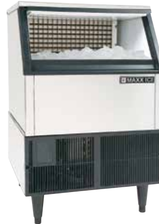
MIM265 24"W x 24"D x 38.6"H