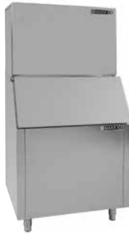
MIM915H 30"W x 24"D x 26.63"H