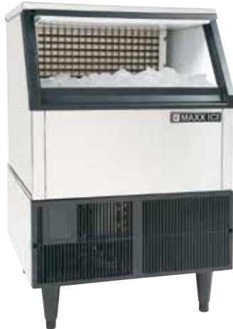
MIM250 24"W x 24"D x 38.6"H