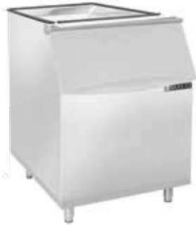
MIB580 30"W x 34"D x 50"H