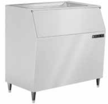
BIN950 48"W x 31.75"D x 50"H