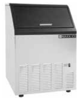
MIM75 16.7"W x 21"D x 32.7"H