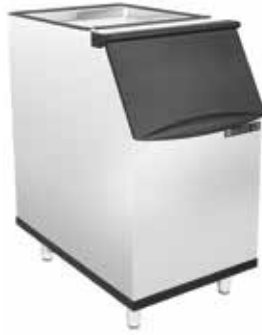
MB310N 22"W x 34"D x 41.4"H