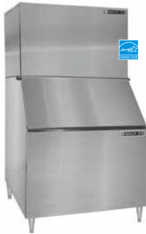
MIM452 30"W x 24"D x 21"H