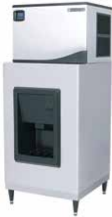
MIDX200 30"W x 32.3"D x 53"H (Shown with modular ice machine, sold separately)