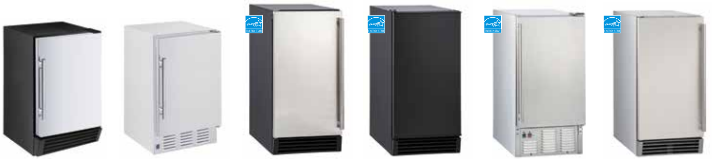
MIM25 14.6"W x 17.9"D x 24.5"H