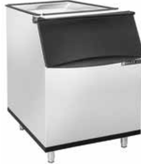
MIB470N 30"W x 34"D x 41.4"H