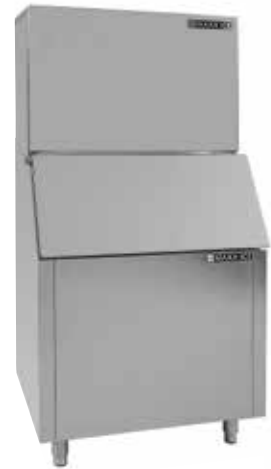
MIM1000 30"W x 24"D x 26.63"H

*Models Shown on a MIB400 storage bin - sold separately