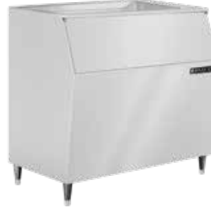
BIN650 42"W x 35"D x 41"H