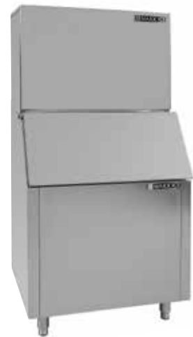
MIM600 30"W x 24"D x 21"H

*Models Shown on a MIB400 storage bin - sold separately