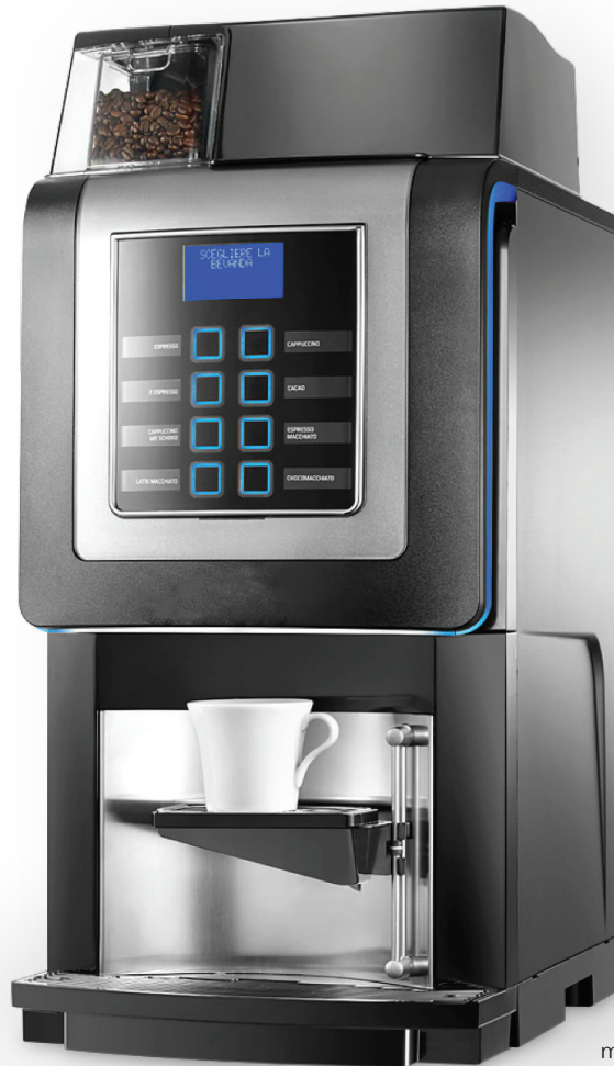
model Korinto Prime