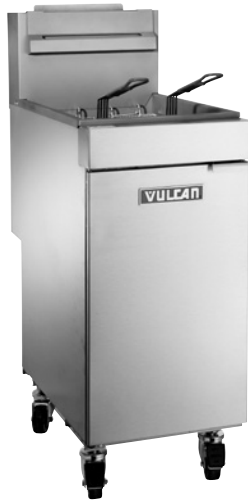
Model LG300 Shown with caster accessories