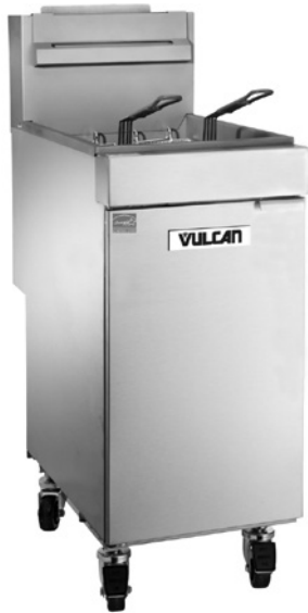
Model 1VEG35M Shown with caster accessories