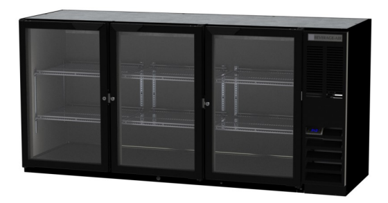
BB72HC-1-G-S (Black model shown)