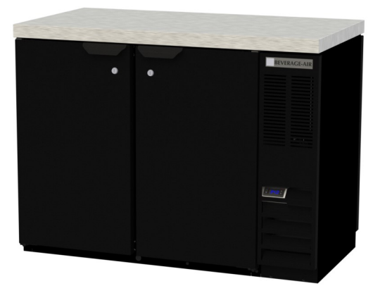
BB48HC-1-B-PT-27 (Black model shown)